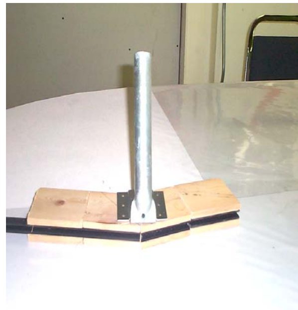
Fig.2-allow part 060052 to rest on 2x4

Mark locations of brackets(part 060052) and the end board( part 060072). One bracket should be flush with each end of the 2x4 and the remaining brackets should be equally spaced as shown (see figure 2).