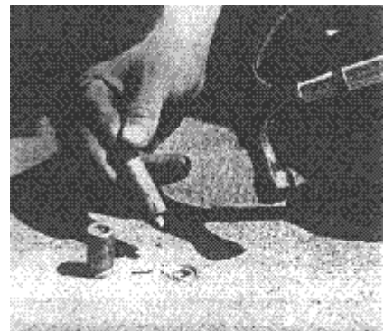
Fig. 4. Installing the lead anchor. The flared end goes down.

Flush cement dust from all drilled holes with or clean with a vacuum cleaner. Set all anchors with the setting tool provided.(Fig4)