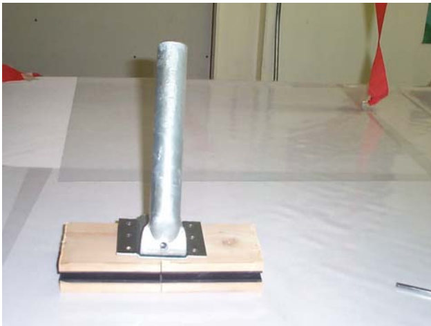
Fig. 3. Notice that all hold down plates(part#060072) are flush with inner edge of foundation. Take care not to hit the locking extrusion with the fastening screws.

Mark location of brackets(part# 060052) on the side boards. Working from the left to right mark the location of the first bracket flush with the left end of the 2x4 foundation board. Next, using the spacing dimensions on the drawing mark the remaining locations of the brackets. The last bracket(right hand end) of each 2x4 board will center over the end of the plate. That is, it will actually rest on two boards- it will cover the joint. See figure 3.